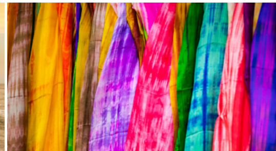
Shop hand-loomed textiles at Barefoot