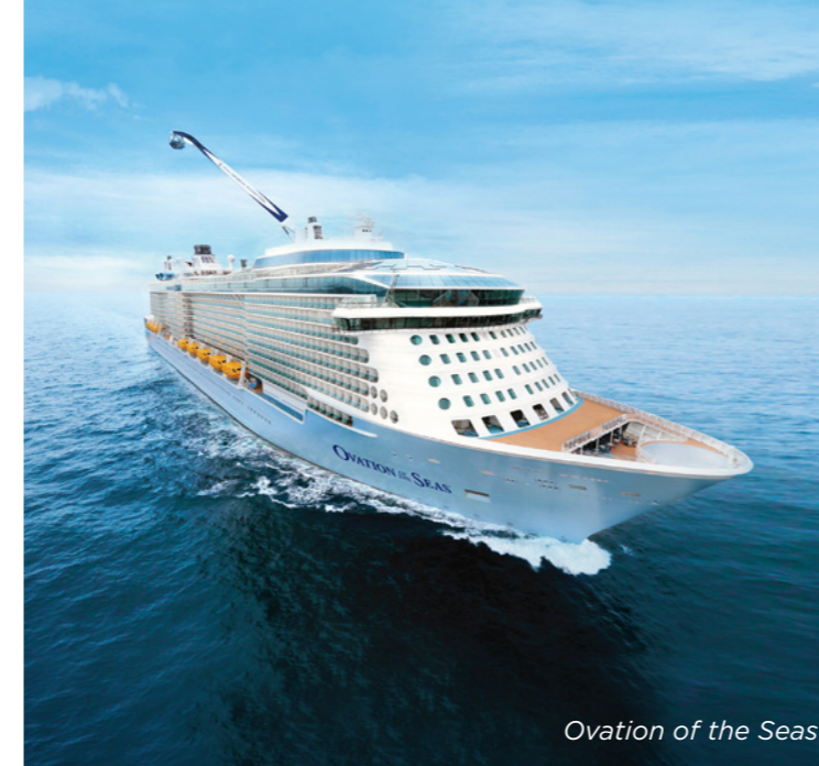
Ovation of the Seas