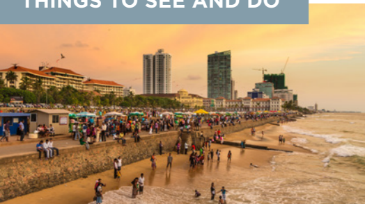
Enjoy a seafront sunset