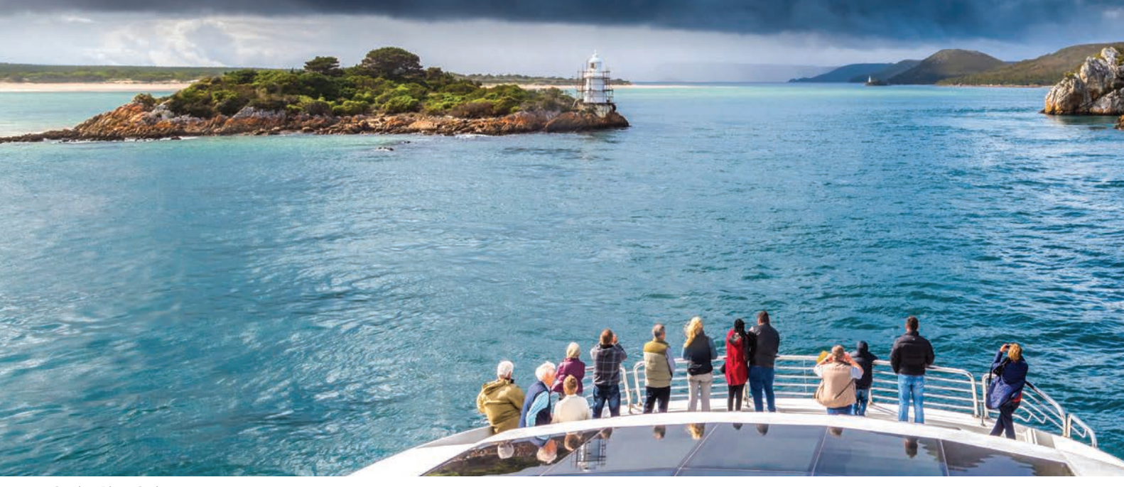
Gordon River Cruise